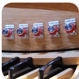
10 toe pistons with programmable functions