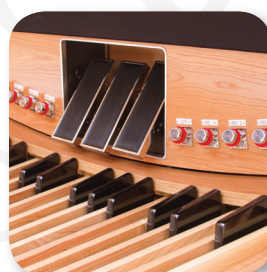
32-note radiating AGO pedalboard

Rodgers Instruments Corporation maintains a policy of continuous improvement of its instruments and therefore reserves the right to change specifications without notice or obligation.