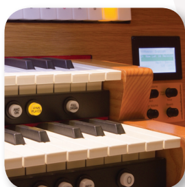
Velocity-sensitive "Ivory Feel" keyboards with optional tracker touch